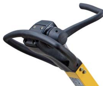
Precise and save to operate BOMAG single lever control