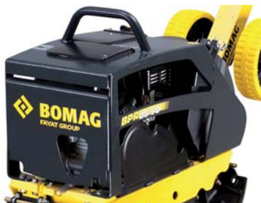
Robust and reliable Best component protection