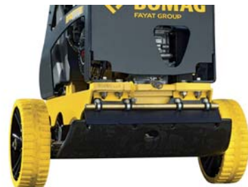
Simple and safe transport Transport wheels (optional)